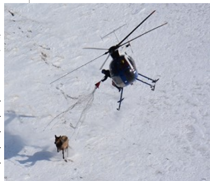
FIGURE 2: Targeted Elk Brucellosis Surveillance Project by The Department of Fish, Wildlife and Parks.

Human infections with RB51 bring into question the practice of brucellosis vaccination in areas where cattle are not at risk of exposure to Brucella abortus . In the U.S., veterinarians and laboratory workers are most commonly infected with RB51. Layperson exposure to strain RB51 can occur not only through consumption of raw milk or milk products, but also through exposure to birthing/abortion tissues and fluids expelled by an animal that was vaccinated while pregnant. These cases remind us that that the vaccine itself poses a human health concern. ✕ By Eric Liska