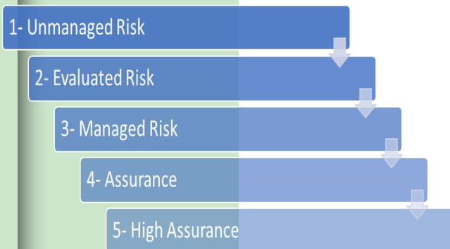
FIGURE 1: Draft Johne's Certification Levels